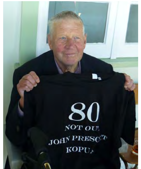
John Prescott celebrates his 80th Birthday