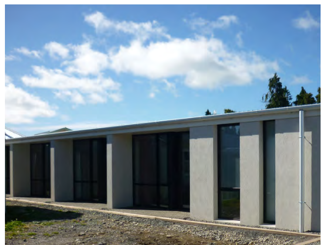
Part of the new accommodation for the monks